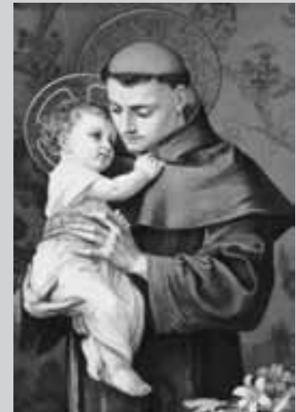
St. Anthony of Padua

Masses: Saturday 5:00 p.m. Sunday 8:30 a.m.